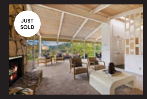
49 Evergreen Dr., Orinda 3 BD | 2 BA | 1,665 SqFt | .56 AC Sold with 17 Offers ~ 30% Over Ask!